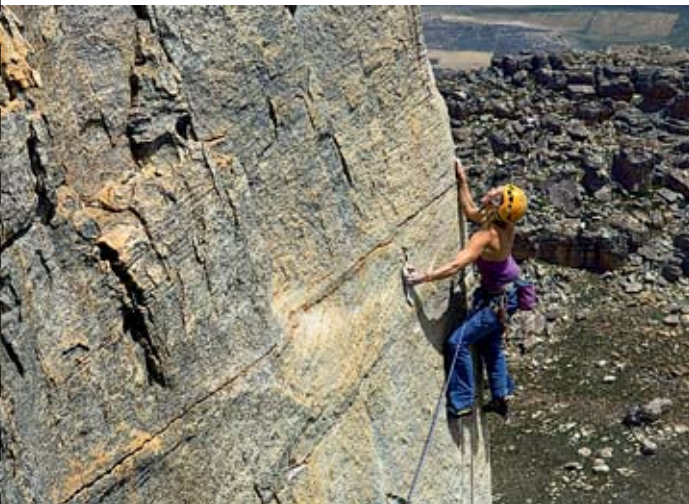
CLOCKWISE FROM FAR LEFT: Niles on P2 of Maiden Voyage (5.10), an FA on “lacquer,” at Blyde; the 5.10+ Magnetic Wall , at Cape Town’s Table Mountain, lures David Vallet over the void; Niles pulls off a stylish fourth ascent of the heady Mighty Mouse (5.11+ R), Tafelberg.

disagree when you see the European-flavored city. Perched above the Cape of Good Hope, it has everything from surfing, to sand volleyball, to Table Mountain (TM). More than 1.8 miles long, this sandstone monolith is one of the largest rock massifs inside a major city. The epicenter of Western Cape trad climbing, TM looms above Cape Town with endless cracks, steep roofs, and huge jugs and sidepulls.