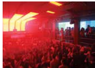
PHOTOS: BARBARA KRAFT (MUKUJU); BRETT AFFRUNITI (ANNAN); CELIN SERBO (RED ROCK CANYON); PERKINS EASTMAN (QUIN).

Only in Europe can you find a giant nightclub in a 15th-century building originally used as a public spa. Enter Prague's Karlovy Lázně , which boasts different styles of music on each of its five floors (everything from hip-hop to EDM), not to mention partially preserved elements from its previous incarnation. karlovylazne.cz